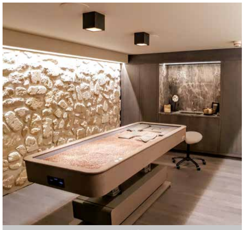
The Lamp Hotel, Sweder

EXPERIENCE THE PSAMMO CONCEPT HERE & IN MANY MORE PLACES.