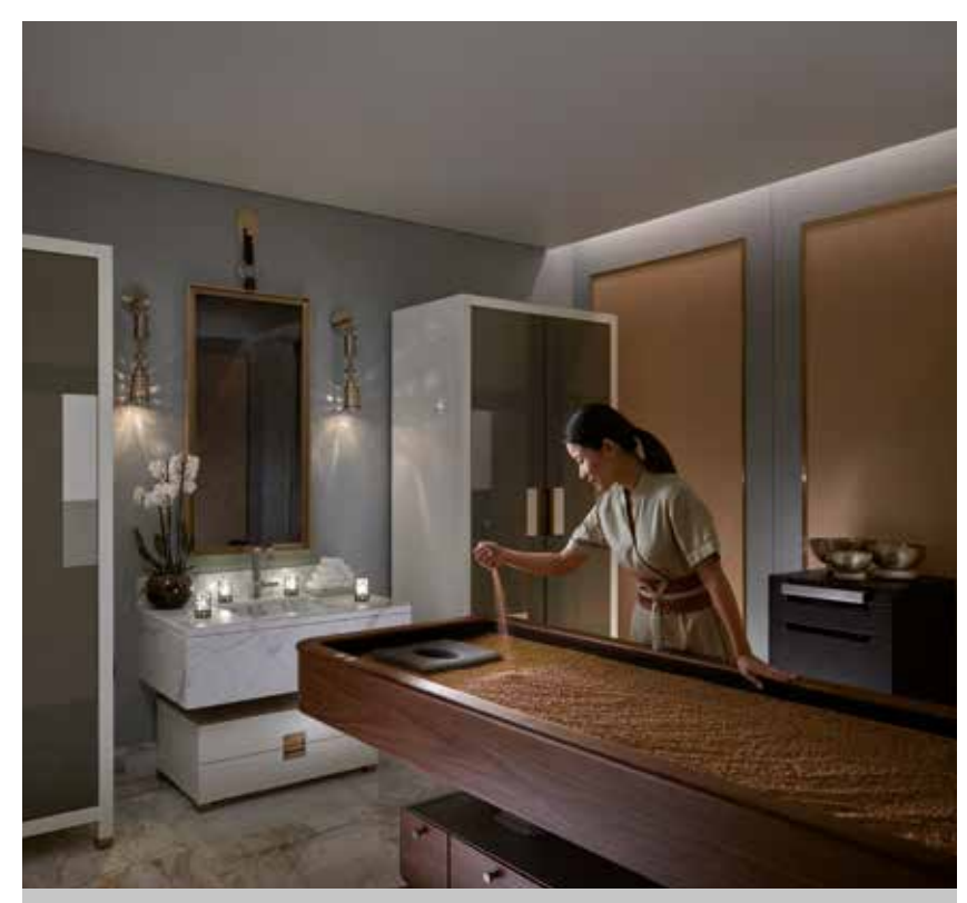
Mandarin Oriental Doha, Qata