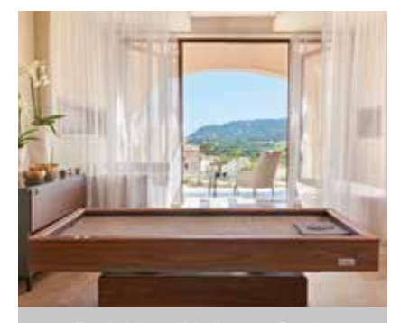
Park Hyatt Mallorca, Spain