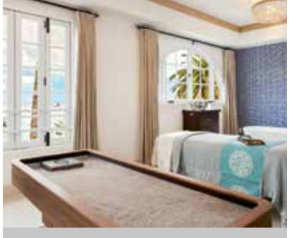
Island Spa Catalina, USA