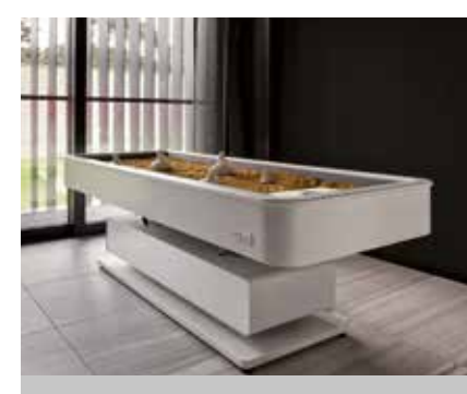
La Butte aux Bois, Belgium